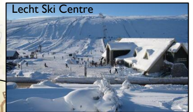
Lecht Ski Centre