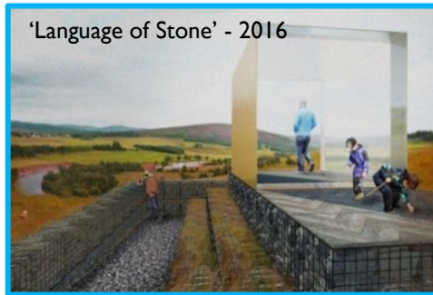
'Language of Stone' - 2016