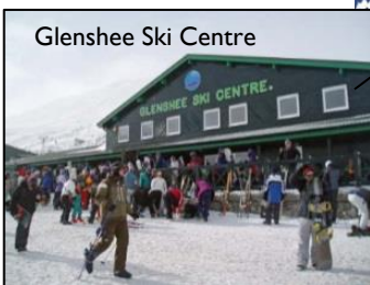
Glenshee Ski Centre