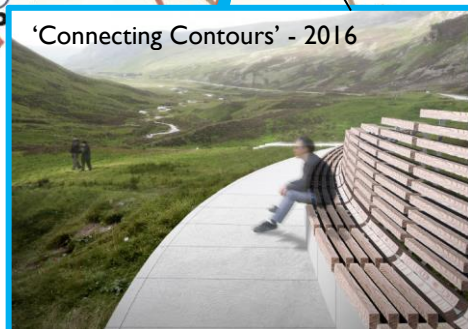
'Connecting Contours' - 2016