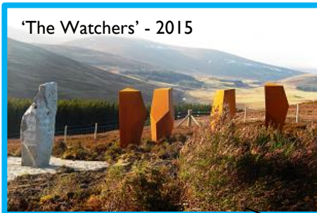
'The Watchers' - 2015