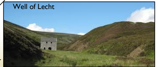
Well of Lecht